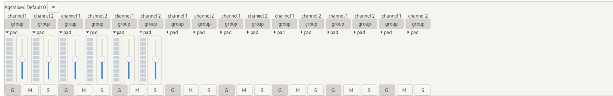
The mixer screenshot

Bundle audio lines with the mixer and perform toplevel stream manipulation. It contains per audio channel a volume indicator and may contain LADSPA or Lv2 plugins.